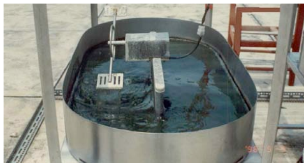
Mini high rate algal Tank, Institute of Post-graduate Studies & Research, University of Malaya, Kuala Lumpur, Malaysia.

Faintuch, Sato and Aguarone (1991) also studied the influence of the nutritional sources on the growth rate of cyanobacteria. They reported that there is very significant influence of mixtures of defined proportions of \text{KNO}_3 , urea and ammonia-N on the growth of Spirulina maxima . The most favourable growth rates of S. platensis occurred in the presence of 2.57 g/litre \text{KNO}_3 with growth rate of 0.3–0.4/day. Chang et al. (1999) studied the possibility of using nitrifying bacteria for the fulfillment of nitrogen fertilizer in spirulina mass culture. They first adapted the nitrifying bacteria with pH 8–10, 0.6–2.2 percent salt and 6–12 mg/litre of \text{NaHCO}_3 in the culture solution. They found that the concentration of \text{NO}_3\text{-N} reached over 20 mg/litre after the nitrifying bacteria was inoculated in the spirulina culture solution and then incubated for 6 days at 25–35 °C.