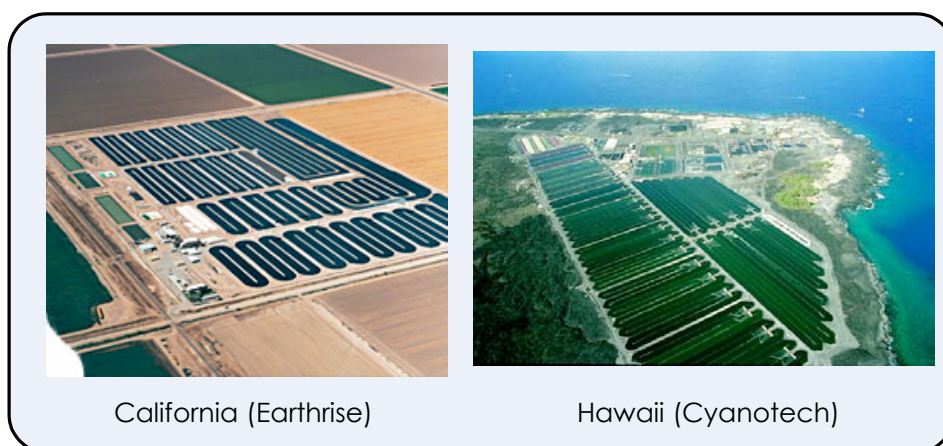
Figure 6: Intensive production of spirulina facilities in the United States of America