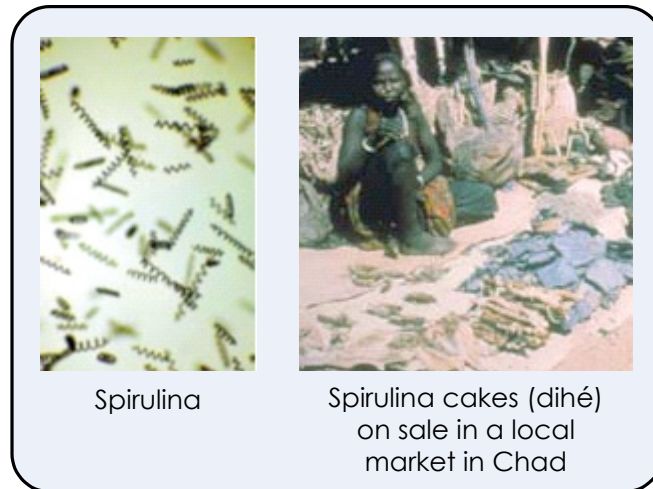
Figure 1: Spirulina and its sales as dried cakes in Chad

Spirulina are multicellular and filamentous blue-green algae that has gained considerable popularity in the health food industry and increasingly as a protein and vitamin supplement to aquaculture diets. It grows in water, can be harvested and processed easily and has very high macro- and micro-nutrient contents. It has long been used as a dietary supplement by people living close to the alkaline lakes where it is naturally found – for instance those living adjacent to Lake Chad in the Kanem region have very low levels of malnutrition, despite living on a spartan millet-base diet. This traditional food, known as dihé , was rediscovered in Chad by a European scientific mission, and is now widely cultured throughout the world. In many countries of Africa, it is still used as human food as a major source of protein and is collected from natural water, dried and eaten. It has gained considerable popularity in the human health food industry and in many countries of Asia it is used as protein supplement and as health food.