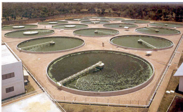
Figure 5: A standard design for industrial production of spirulina